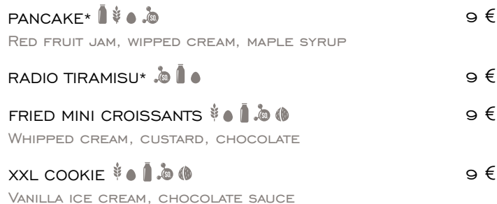
TABELLA ALLERGENI ALLERGENS TABLE